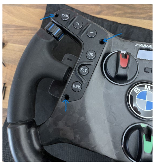
This will allow the wheel to open slightly. There might be some glue so ease it up slowly. DO NOT pull the wheel front off too far, there are wires still attached that are quite fragile.

You can get the front open enough to get to the \ensuremath{\mathsf{PCB}} plug on the wheel motherboard.